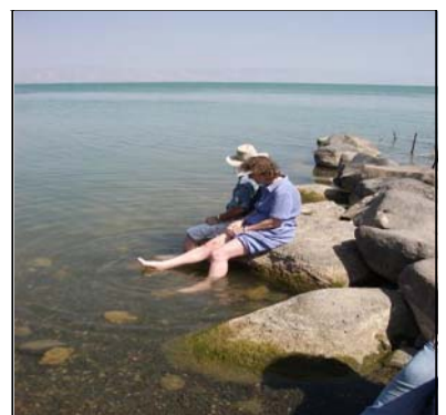
Meditating on the Sea of Galilee