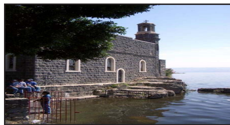
Primacy of St. Peter's Church