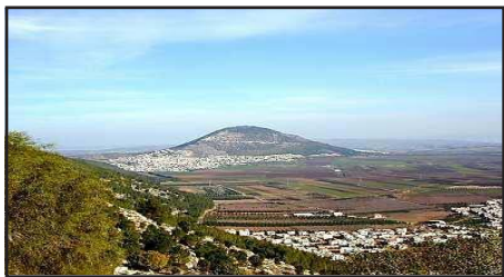
Mount of Transfiguration