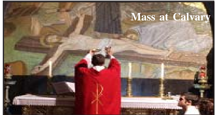
Mass at Calvary