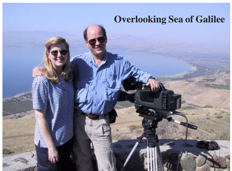
Overlooking Sea of Galilee

We personally invite you to join us on this trip of a lifetime!